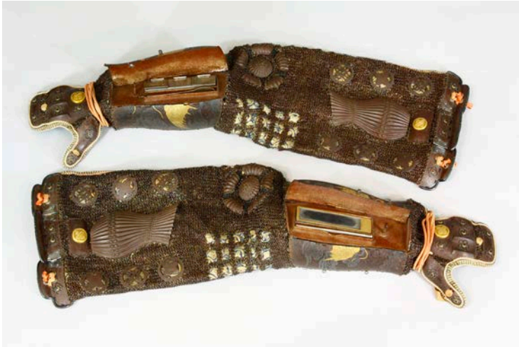
Sleeves of Tubular Form ( Tsutsu gote ). Cast iron, gold leaf. Crow Collection of Asian Art, 2014.166.1.